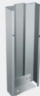
Floor base anchor